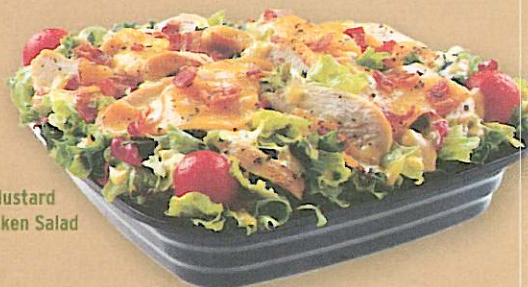
Honey Mustard Chicken Salad

* Net carbohydrates = total carbohydrates - (minus) dietary fiber - (minus) alcohol sugars. Some items need dressing eliminated to achieve low net carbs.