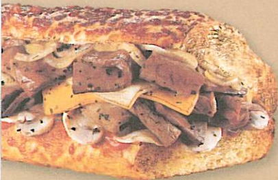
Black Angus Steak

Every Quiznos sub is made with the finest quality ingredients and is flawlessly designed to not only add extraordinary flavor to the sandwich, but to make the perfect recipe for toasting. Your Quiznos sub is toasted so all the flavors of the ingredients - from the premium meats to the real cheeses - burst through in every toasty bite.